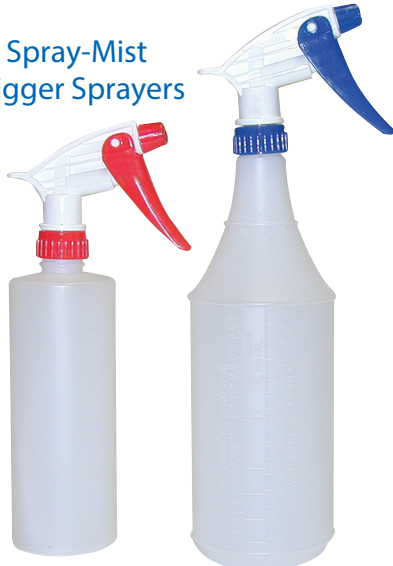
901 - 16 oz.